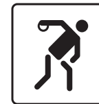
Puzzle 7 Wei-Hwa Huang Discus Diagonal Sudoku