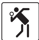
Puzzle 3 Shot Put 0-9 Sudoku