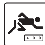
Puzzle 5 400m Classic Sudoku