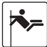
Puzzle 8 Thomas Snyder Pole Vault Digital Sudoku