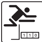
Puzzle 6 Thomas Snyder 110m Hurdles Just One Cell Sudoku