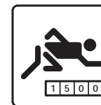
Puzzle 10 Thomas Snyder 1500m Classic Sudoku