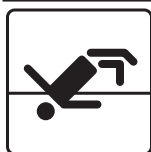
Puzzle 4 High Jump Consecutive Sudoku