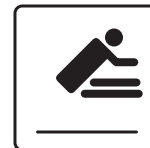
Puzzle 2 Long Jump Killer Sudoku