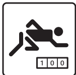
Puzzle 1 100m Classic Sudoku